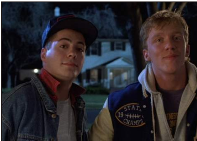
Leo and Johnny show off their smirks.

Johnny Be Good is a terrible movie. Let's get that out of the way right now. It is bad. There is no reason to try to defend it. It's an abomination. And to be honest, I can't tell what this movie wanted to be. It's set up to be a movie about the college recruiting process of a high school football star. But is it supposed to be a zany comedy, or a serious look at rule-breaking recruiting practices? I don't know and I don't think the