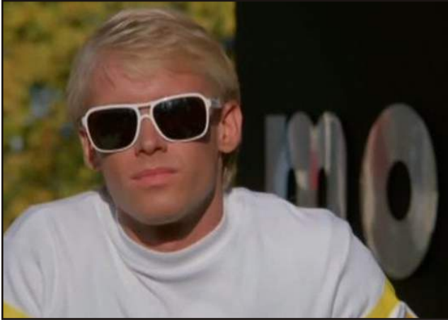
The future's so bright.

surprising, is that the town of Cochran was totally supportive of both the BMX race and Cru. When Duke starts enforcing, or inventing, rules that were never previously mentioned in order to derail Cru's Helltrack appearance the town rallies behind him.