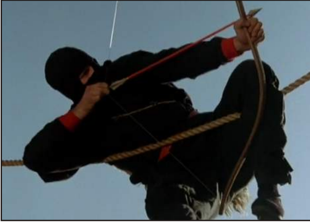
The ninjas are coming for you.