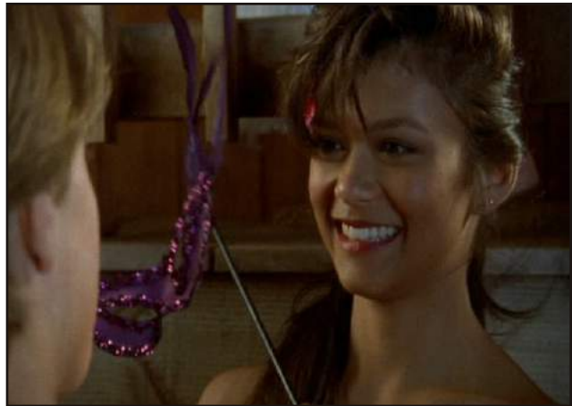
Kiani takes a shine to Rick.

Rick surprises everyone with how well he does in the contest, beating out some of the pros, but because he's some virtuous soul surfer, he's not supposed to be