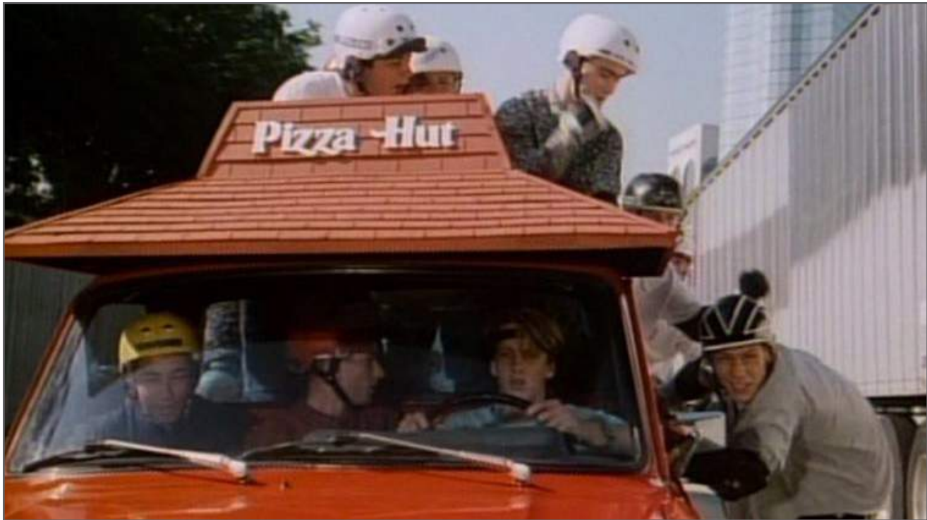
Brian and his pals prepare to take out the Noid.

The movie culminates in a huge chase sequence, and it's all so beautifully-over-the-top. Like William Wallace charging into battle with his men, Brian, now back in skater form, leads his blindly loyal rag tag team of skate friends to Colonel Trac, where Lawndale, the gun-toting arms dealer is taking hostages. The omniscient Detective Lucero is also not far behind. And of course, the good guys prevail. You're welcome, America.