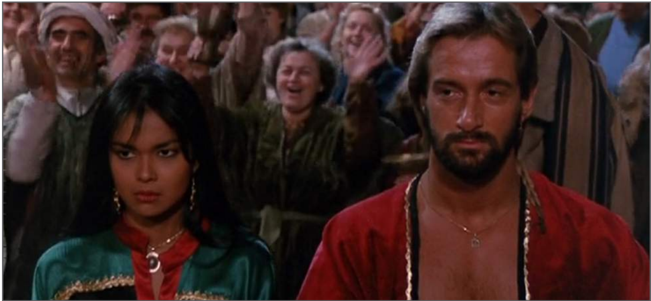
The princess is thrilled about her wedding to Zamir.

anyone trying to avoid an obstacle will be instantly killed. Also, ninjas hunt the contestants as they go along.