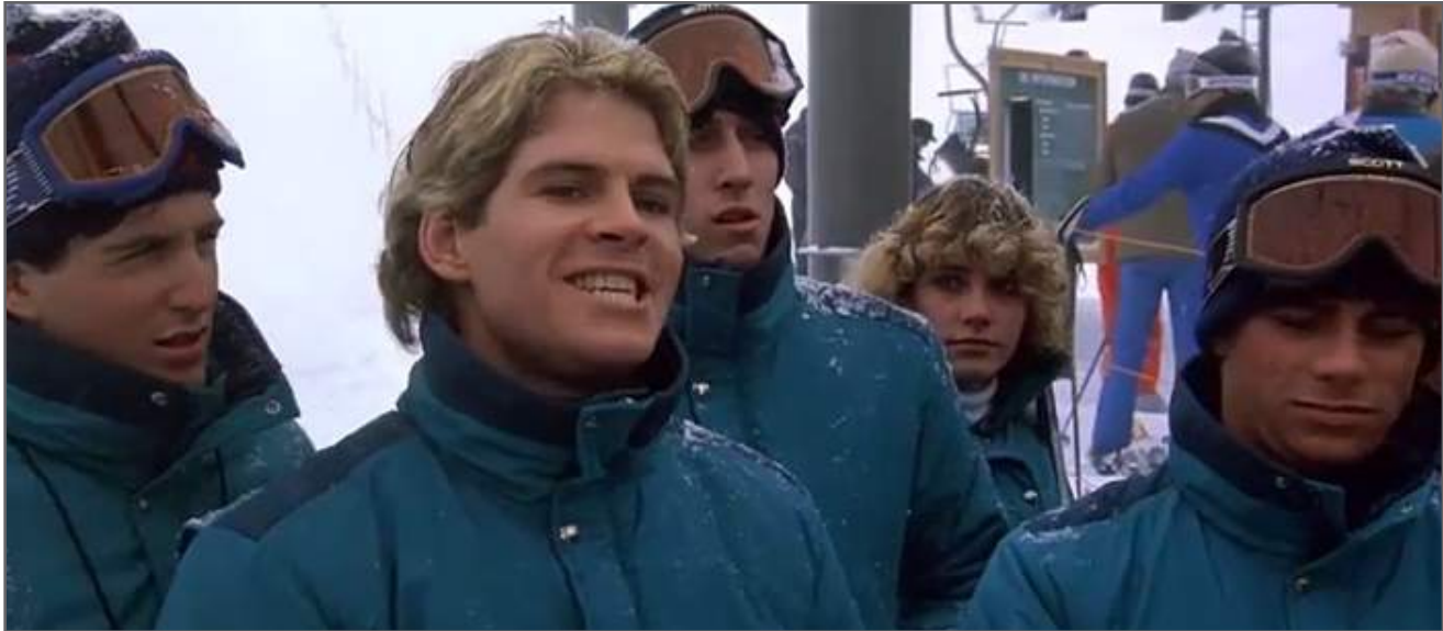
Roy Stalin and his well-oiled machine.

be, in the words of Seinfeld's Jackie Chiles, “the most public of [his] many humiliations yet.” Which is why Lane only challenges Roy to the race in a fit of temporary insanity, driven to the brink by a guy who won’t stop rubbing in his face that Beth chose him over Lane.