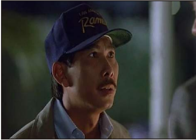
The “just watched the ‘89 NFC game” look.