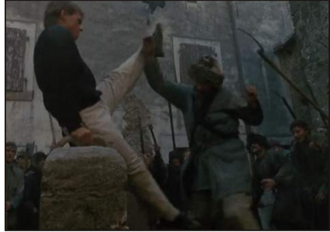
Note the well-placed pommel horse.

much more of a clown. He's small, with a crazy comber, and bears an uncanny resemblance to Mel Brooks. The people of Parmistan are also another wonder of this movie. They all appear to be old and toothless, and, oddly, English seems to be their native language despite the fact that Parmistan is located not far from the Caspian Sea.