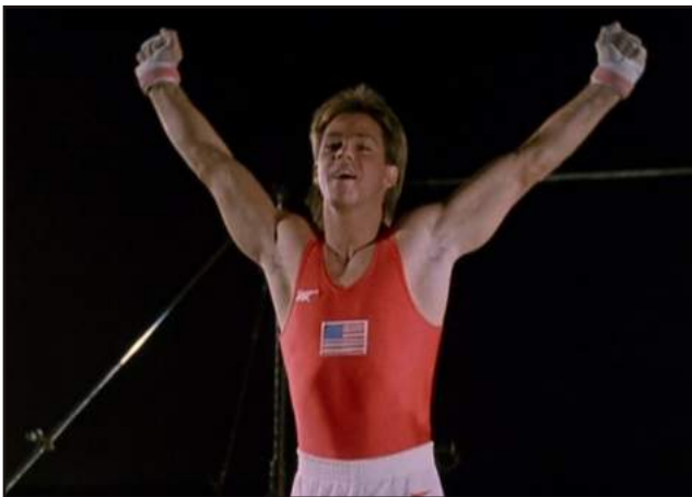
Karate gymnast in training.

Not only is Gymkata the second movie featuring an American Olympic gymnast in this issue of Girls, on Film (in addition to Rad ), but it is also a B-movie with cheesy stunts, bad acting, and karate, one of the preferred methods of self-defense in the 80s. It's hard to take this movie seriously, which actually made it kind of fun to watch. While confusing at times, Gymkata proved to be a classic bad movie that is perfectly set up for parody.