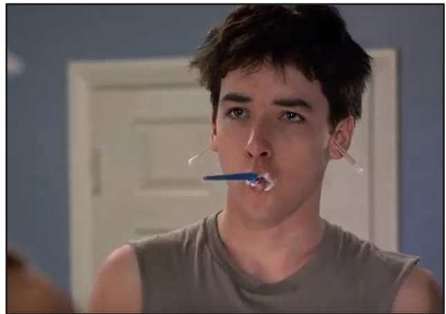
The once-great champion.

But, Charles, who's been going to Greendale High for 7 ½ years and is certainly no dummy has a plan to help Lane win Beth back (or, at the very least, to impress any of the other available girls): Lane must beat Roy in a ski race on the K-12.