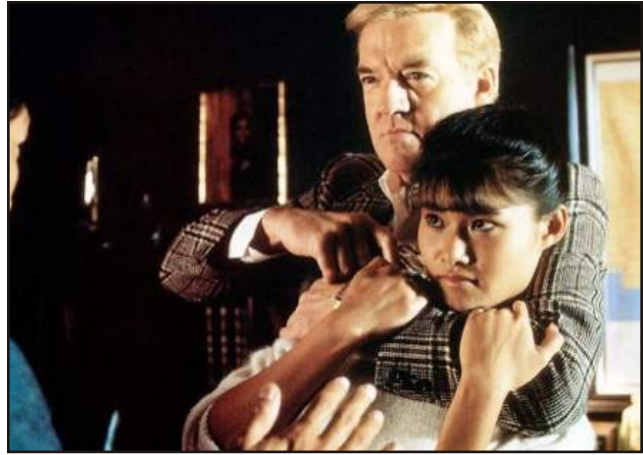
Lawndale, the well-dressed hostage-taker.

The only clue Vinh left behind was the piece of paper with the suspect shipping