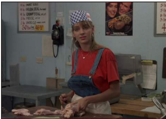
Uma's about to throw that chicken.

Meanwhile, back at home, Johnny's family and friends fall victim to recruiters' bribes and schemes to get them to help convince Johnny to attend their schools. Also, Georgia, aware of the fact that there are girls throwing themselves at Johnny, gets mad at him because she suspects he cheated. While working her job at a butcher shop, they argue and she throws a whole chicken at him. A quick side note, this movie is rife with misogyny, but to Johnny's credit, he never actually cheats on Georgia that we see. He does go to strip clubs, and enjoys having women all up on him, but there is no kissing or sex. So, there's that.