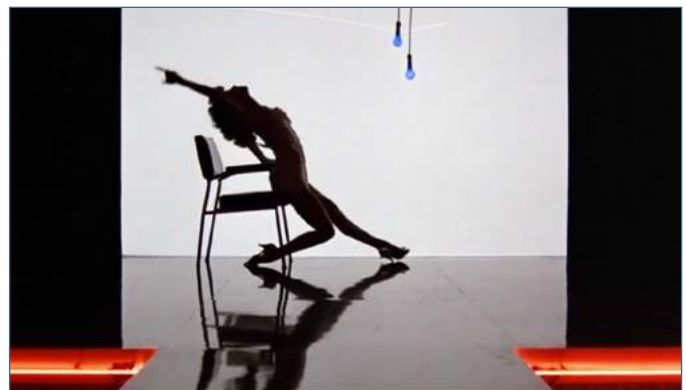
Wild sex in the working class.

Flashdance has been credited with resuscitating the musical genre, which I was surprised to learn at first, given the success of Fame only a few years earlier. But, part of the reason why this has been attributed to Flashdance is that it helped to reinvent the genre. The characters didn't punctuate the narrative with campy show tunes. They were much too hip for that (also, they saved that for Flashdance: the Musical ). Instead, the movie showcases dancing, coupled with a catchy pop soundtrack, which also made marketing to the MTV crowd fairly easy. And once the movie and the soundtrack both became a hit, studio executives were suddenly blowing their loads at the pitch meetings for similar films. In the year following Flashdance alone, Beat Street , Purple Rain , Breakin' AND Breakin' 2 ( because Cannon films never was one to piss around ), Streets of Fire , and Paramount's Footloose , were released. Not bad for a dubious underdog.