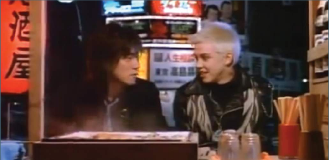
Wendy meets Hiro at a street-side ramen joint.

Hiro's band wants to recruit Wendy to sing with them, hoping that a gaijin might finally get them noticed by the famous producer, Mr. Dota (Tetsurô Tanba). Wendy, wary of joining yet another boyfriend's band and not being taken seriously, decides to audition with other bands. But, when she finally gets a gig, she's too excited to notice how terrible it is, and questions her talent rather than her screening process. Hiro later tries to cheer her up when they are alone together, asking her to join him in an acoustic version of "(You Make Me Feel Like) a Natural Woman." Wendy demonstrates her talent, and Hiro, his sincerity.