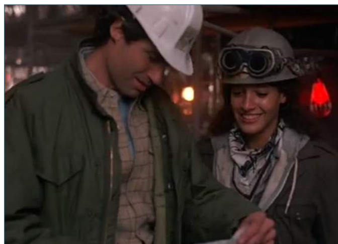
Cue the Fraggle Rock theme.

Set in quintessentially blue-collar Pittsburgh, Flashdance follows the tradition of the working-class hero chasing big dreams much like Tony Manero in Saturday Night Fever . Alex Owens (Beals) is the teenage Steel Town girl who's looking for the fight of her life. That might be overstating it a bit, considering that Alex's circumstances aren't all that bad, nor her goal all that extreme. She has a (presumably) good-paying day job as a welder. She's a talented exotic dancer in a neighborhood bar where she can remain clothed AND doesn't get harassed (well, except by that asshole, Johnny C.). She shares an awesome loft with her mellow pitbull. And, there really isn't anyone pressuring her about what direction to take in life (because who the hell knows where her family is?) And for all its sexiness, Flashdance's main character is pretty wholesome.