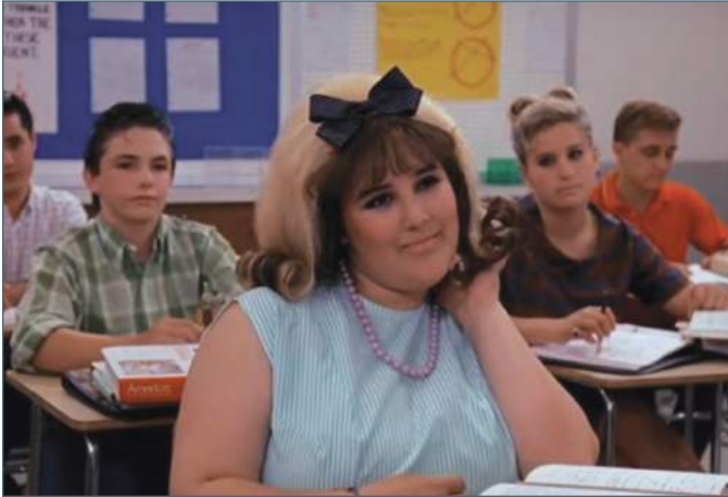
Tracy's bleached, teased hair eventually lands her in Special Ed.

(Ruth Brown), a black DJ and record store owner who frequently appears on the show. When Amber's mother, Velma (Debbie Harry), scolds her for requesting "Shake a Tail Feather," a song by the black group the Five Du-Tones, Amber explains that it's a good song and seems nonplussed by her mother's worry about what the neighbors might think.