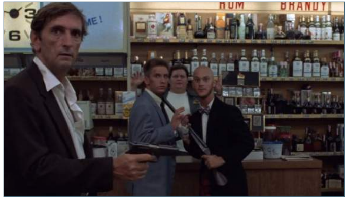
Worlds are colliding.

Just as the repo men stand apart from ordinary people, so, too, does Repo Man stand apart from ordinary films. The plot is so wonderfully weird. Cox drew aesthetic inspiration from underground comic books from the 60s and 70s. The movie is endlessly quotable (and I hope that “Repo man’s got all night, every night” found its way into the late Harry Dean Stanton’s eulogy). All of the characters, even the most minor ones, are captivating. And, I don’t think the filmmakers could have assembled a better cast.