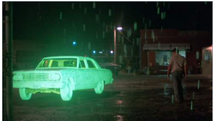
Plutonium Green is a custom order.