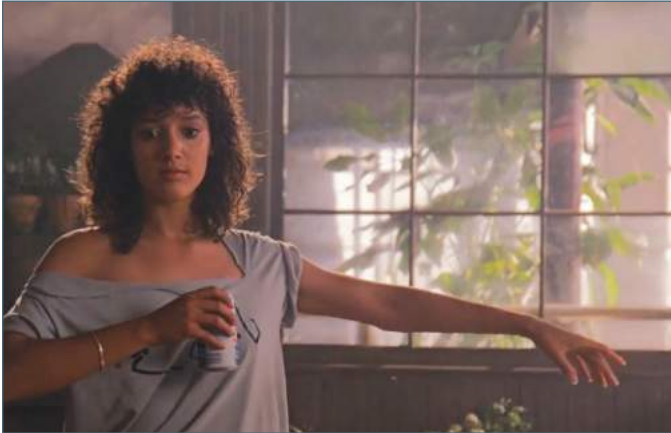
80s hair was no match for necklines.

But, what Flashdance lacks in substance it certainly makes up for in style. In fact, the movie earned a Razzie nomination for Worst Screenplay, as well as Academy Award nominations for Best Editing