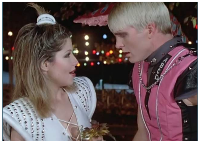
Dee Dee wants to monetize the novelty of playing in an alien band. ABCD is not feeling it.