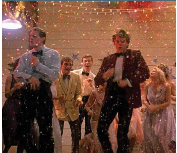
The kids of Bomont cutting loose at the Prom.

Finally, the biggest question comes from the writer's decision to deny the kids the opportunity to have a prom. In the story of Elmore City, the high schoolers win. Why would the writers of this movie not include this? It's the perfect cliché ending that would have provided a moment of redemption for the people of Bomont. Instead they turn a story with a happy ending into a depressing commentary on the persuasion power of a religious leader mired in grief and guilt. As the movie ends with another high energy dance sequence to Loggins' "Footloose," the viewers are left to reconcile the upbeat, carefree song with the sad state of the repressed people of Bomont and the inability of the religious community to accept change.