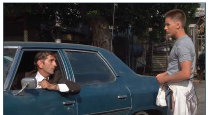
Bud propositions Otto.