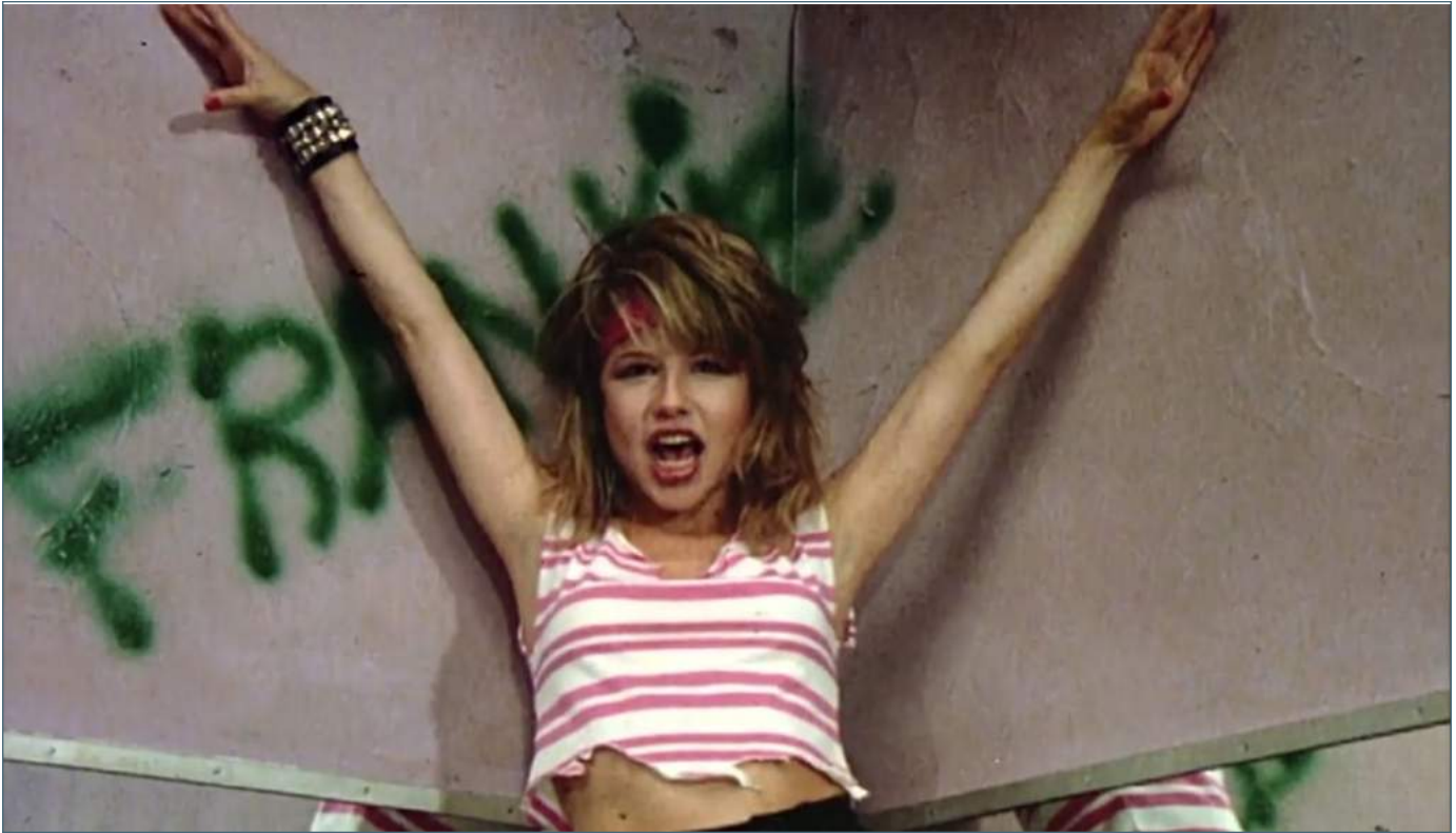
The writing's on the wall.

Zadora) and Frankie (Craig Sheffer), the Annette and Frankie of this movie. While they seem to be in a relationship, they have few interactions that make me think they actually like each other. Dee Dee is completely consumed with singing in Frankie's band, The Pack, and Frankie is adamant that no one sings in his band but him.