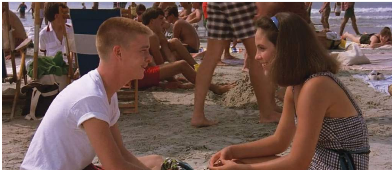
Chip and Pudge sit on the beach and dissolve into adorable puppy love.

Upon arriving in Myrtle beach, they conveniently stay at Luanne's parent's summer house, but since they don't have permission to be there Luanne says they cannot touch anything, sit on the couch, or use the phone. As the girls all get ready for a night out on the boardwalk, Carson starts to cry at the thought of her friends all leaving for college while she is in Spartanburg and married to Harley (Tyrone Power, Jr.). They console her and promise to write letters every week, but it's already pretty clear that Carson is not looking forward to her future with Harley.