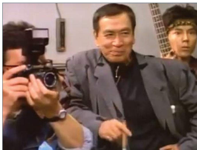
Say "cha-ching" for the camera!

But it's not all tragic romance; this is, after all, a movie about rock n' roll. There's a wonderful quirkiness as well, such as the scenes of the band creatively attempting to get their demo tape to Mr. Dota; Hiro's old-fashioned grandfather complaining about his mother's egregious lack of domestic skill as a gigantic bucket of KFC graces the dinner table; Hiro's father, an artisan of plastic replicas of food telling Hiro he should give up rock n' roll and get a lucrative job like making plastic food; the drunk businessmen in the hostess bar proudly telling Wendy in broken English about the mid-range companies they work for; and the several musical performances peppered throughout. Altogether, it's a wonderful little indie film, though a woefully obscure one at that. For now, see it on YouTube.