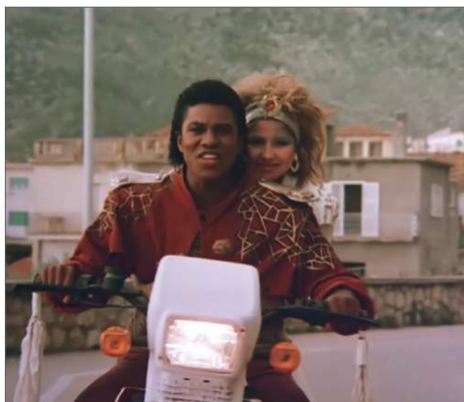
The unrelated Jermaine Jackson and Pia Zadora music video.

The aliens head for the small town of Speelburgh where, on the shores of Lake Eerie (home to a giant sea monster), the teenage population is having a beach party. Here we meet Dee Dee (Pia