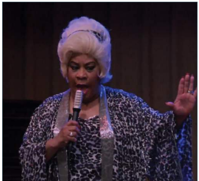
Motormouth Maybelle gets the white kids dancing.

When Tracy and Penny go to dance at Motormouth Maybelle's record store, Prudence follows their bus and then wanders around