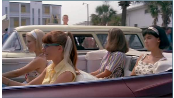
The girls arrive in Myrtle Beach.

The movie begins as Luanne (Paige Hannah) picks up her friends for a weekend together prior to Carson's (Phoebe Cates) wedding. They've told their parents they are going to Fort Sumter to tour civil war monuments, but Luanne, Pudge (Annabeth Gish), and Melaina (Bridget Fonda) have decided to surprise Carson with a trip to Myrtle Beach instead. Carson is initially upset about this change in plans, but her friends try to convince her that it will be fun. And, of course, it is!