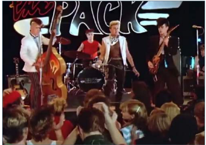
The Pack take the stage at the cotillion.

In addition to the sea monster, the writers also included an escaped mental patient who roams around town killing people with a chainsaw. Only named Chainsaw (Michael Berryman), he goes after Diane (Alison La Placa), Dee Dee's best friend. He has her cornered when his chainsaw breaks, and then she helps him fix it. While