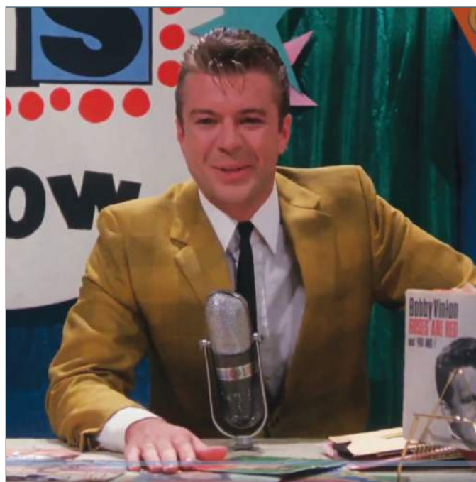
Corny Collins broadcasting to the teenagers of Baltimore.

In the midst of the competition between Tracy and Amber is a battle to integrate The Corny Collins Show . The kids on the council (current dancers on the show) laugh at the idea. But Tracy uses her new-found fame to push for integration, and even participates in protests to allow black kids to dance on the show. Waters makes a point to show that while the kids on the council scoff at integration, they request and dance to music by black artists. They also love Motormouth Maybelle