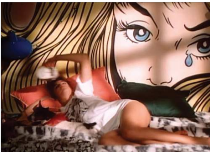
No 80s bedroom is complete without a giant mural.

the three women should plainly see how wrong they're going about all of this.