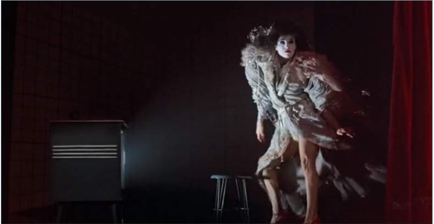
Chanelling a classic Maxell ad...