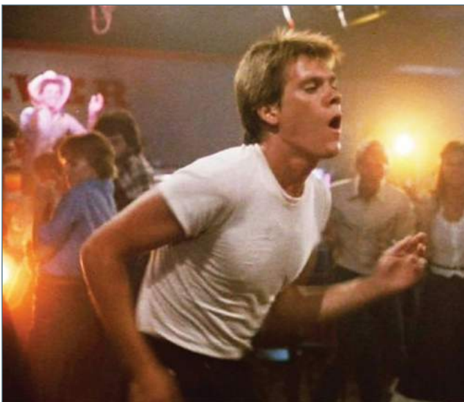
Ren cutting loose in a Texas dance hall.

Herbert Ross' 1984 teen drama, Footloose , is loosely based on the true story of Elmore City, OK where, in the late 1800s, lawmakers banned dancing within city limits. In 1980, the junior class at the local high school, tired of having class banquets with no dancing, lobbied the town council to allow dancing at the prom. While Elmore City was divided on the issue, local pastors voiced their