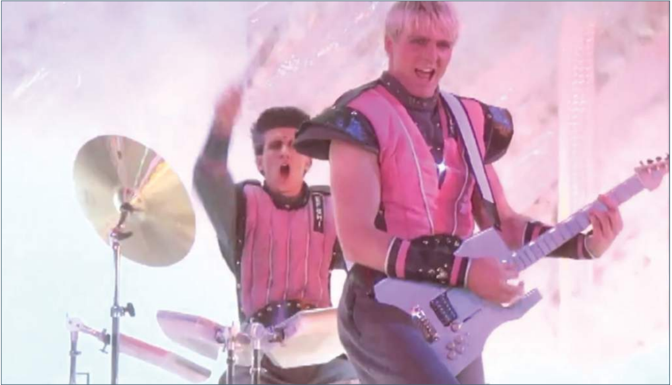
ABCD and the alien band doing their best Devo impression.

Diane is fixing the chainsaw, Dee Dee and Frankie have reunited at the high school, but are now being attacked by the giant sea monster. Diane gets the chainsaw fixed right in time for Chainsaw to cut up the sea monster's tentacle, forcing the monster to retreat back to the lake. After he saves the day, Diane and Chainsaw go off together for a date. However, given Chainsaw's past activities, we can only imagine he brutally murdered her on the shores of Lake Eerie.