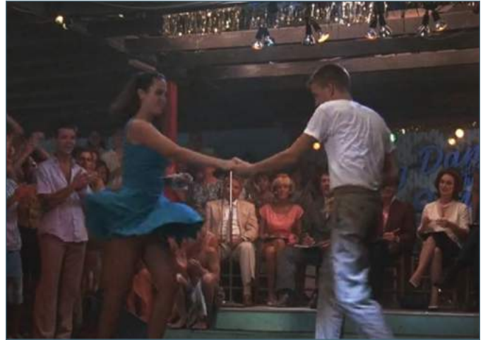
Chip and pudge crush it in the shag contest.

During the party Buzz and Carson hide out on Luanne's parent's yacht. Her friends run interference with Harley the entire night telling him she was sick and took a bus back to Spartanburg. Carson ends up sleeping with Buzz, or, as Pudge says, she "went all the way." The next morning she tells Harley she doesn't want to get married, which we knew at the beginning of the movie, and their wedding is eventually called off.