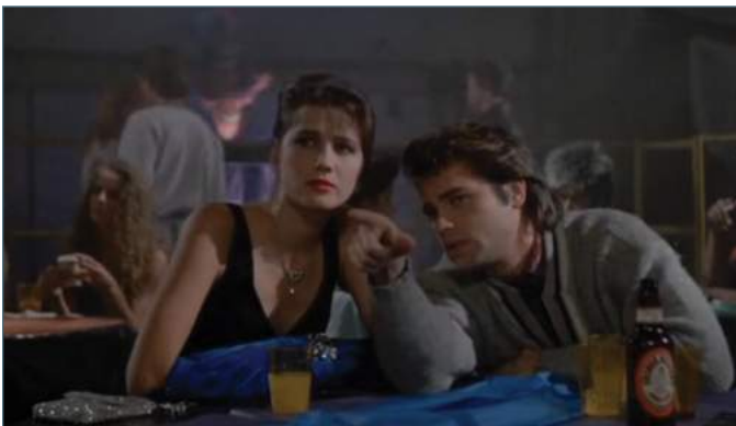
Margot's curious moment.

contrived. Margo appears to have run the gambit on men, with unimpressive results. When Cliff complains that “no one in L.A. reads anymore,” Margo, without missing a beat, tells him that she was a comparative literature major. A classics major himself, Cliff perks up at the news, until she tells him that she “mostly majored in men.” At least one reason for Margo still being single is her impossibly high standards. She even dismisses Cliff as the boring Nice Guy. But, the filmmakers, very subtly, seem to imply that there is another reason. When Cliff and Margo are hanging out at the first club, she points out the flaws in a smorgasbord of guys she seems to have been romantically linked to – from hairband types, to rich cool guys, to khaki-clad yuppies. When Cliff asks Margo why she even bothers coming to the club, she gives a sideways glance and looks out. The camera quickly cuts to a blond woman in a bikini top and tight white skirt dancing by herself. Could Margo’s problem with men be that she’s actually attracted to women? If so, the possibility is abandoned for the rest of the film, since Margo later tells Cliff that she’s sure the perfect guy is out there and she’ll one day find him.