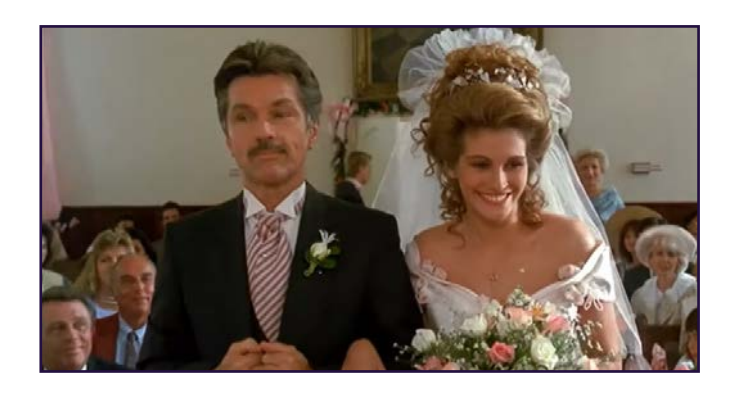
Big hair for the big day.

would never know who his mother was. As he told Country Living Magazine in 2017, "All I wanted to do was have somebody remember her" [3]. It started as a short story but felt more comfortable as dialogue (Harling was an actor at the time) [4].