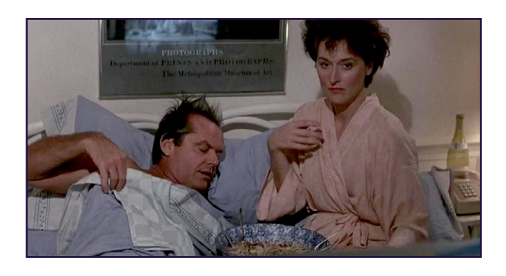
The look... of love... is in... their eyes.

sounds messy and might result in something of a messy creative pursuit, well, join the club and keep reading.)