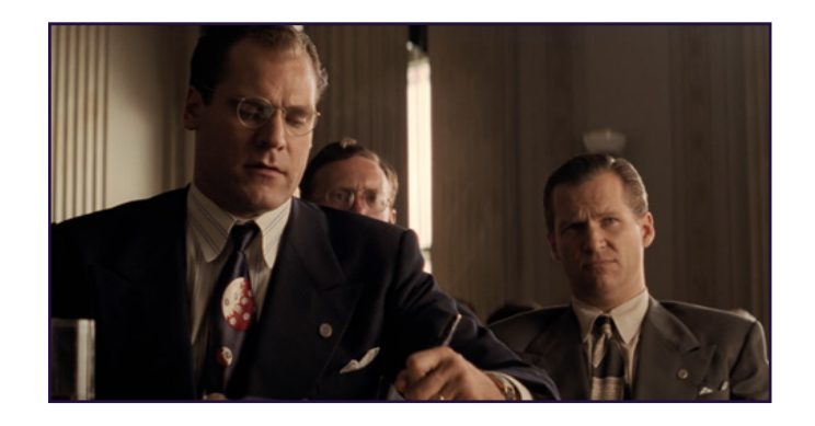
Tucker defends his good name.