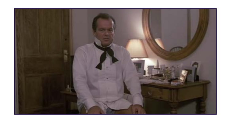
Time for a little chat.

A film with a basis in drama also found itself