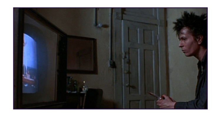
The end of an affair.

Notably, right up until the final edits, the film was supposed to be named Love Kills (Joe Strummer performs the title song of the same name), but the crew decided to play into the Romeo and Juliet feel with the title, Sid and Nancy [5]. Undoubtedly, the name change did create a new meaning for the film and how the