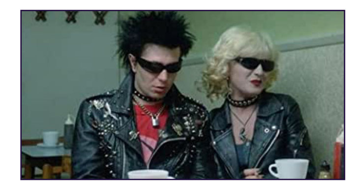
The ____ Generation.