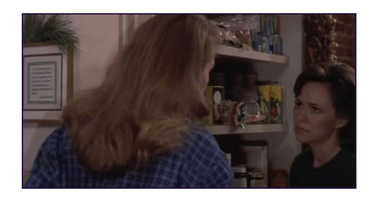
"A little piece of immortality."

The inattention to these characters seemed to coincide with observations in his own life. In an interview with Garden & Gun in 2017 , he recalled the differences in the way the men and women behaved at the family's house after the funeral. They completely fell apart. "My dad couldn't talk about anything; none of them knew what to do." Meanwhile the women gathered in the kitchen, joking and telling stories and remarking on what's needed in the food. "This is very interesting," Harling said, "the women are getting it done and the guys