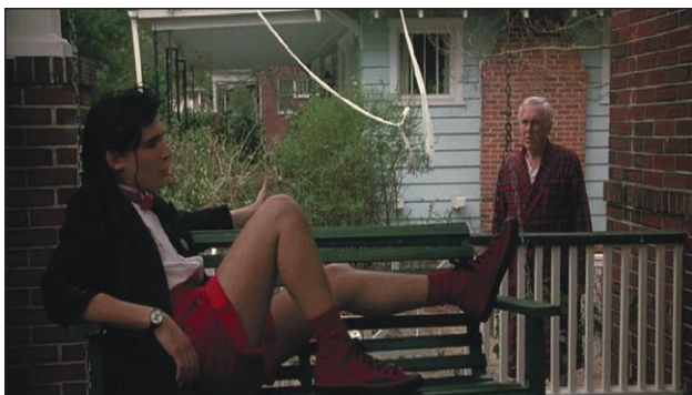
BOOMER VS. MILLENNIAL REMAKE POTENTIAL.

Coleman becomes Bobby. The old man himself disappears. Gena also disappears. Lainie is still Lainie, but she starts having dreams where Gena is packing up the couple's house. Coleman (as Bobby) has to find Gena and Dream Gena is searching for Coleman. So, let's call the whole thing off!