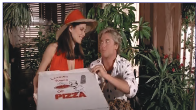
MARVEL THE DIGS AT CONSUMERIST CULTURE!

Hunk sneers at yuppies for their obsession with the superficial—money, sex, materiality, the usual suspects. Bradley wants in to the yuppie elite.