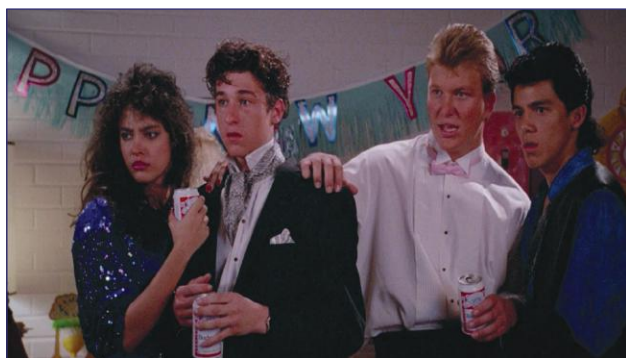
RONNIE GETS GIRLS AND JOCKS TO LIKE HIM.

Cindy, however, really started to like Ronald. You see, Cindy isn't just a dumb, popular, cheerleader. She writes poetry, she struggles with her