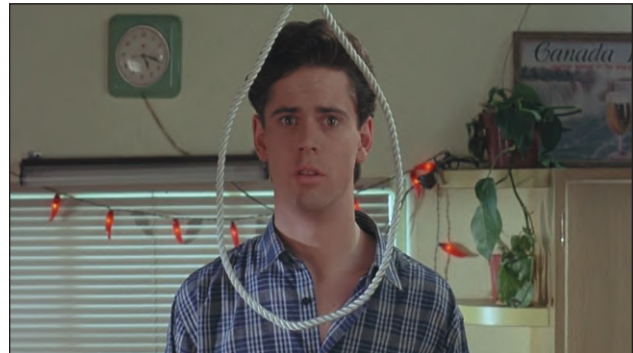
ALWAYS SMART TO INCLUDE NOOSE IMAGERY IN A BLACK FACE MOVIE.