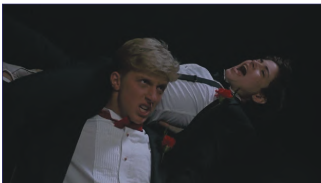
ALWAYS A BULLY.

So, Terry decides to see her plan through and pose as a guy for the week. This leads to all sorts of hijinks, including figuring out how to use the bathroom when, for some reason, none of the stalls in the men's room have doors; setting off the fire alarm so she doesn't have to change in the locker room; and fighting off the advances of Sandy (Sherilyn Fenn), the girl who falls for Terry. In addition to all this, Terry has to deal with Greg, the school's bully, played by everyone's favorite 80's villain, William Zabka.