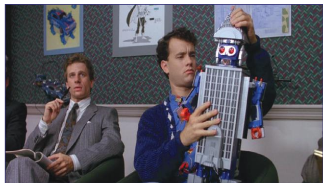
THE BIG PROMOTION.

Unable to return home looking the way he does, Josh gets a room at seedy hotel and lucks into a job doing data entry for a toy company. The elderly boss (Robert Loggia), who seems frustrated with how to market toys to the 13+ crowd (hint: wait two decades), is impressed by Josh's insights when they bump into each other at FAO Schwarz. They bond over a round of "Heart & Soul" on a giant floor piano and then the boss promotes him to the marketing team. He gets a huge office and the privilege of playing with toys all day.