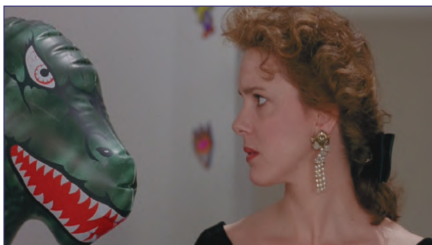
THE BIG SURPRISE.

of squash and then starting a fight with him when it doesn't go his way. Josh's other co-worker, Susan (Elizabeth Perkins), who has long been around unremarkable men – including Paul – finds both Josh mysterious and alluring.