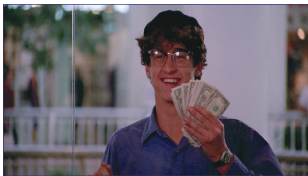
RONNIE MILLER FLASHING BILLS.

Enter Ronald Miller. Ronald spent all summer saving his money from cutting lawns to buy a new telescope. However, when he sees Cindy arguing with the guy at the suede store, he rushes over to her and offers her a deal. He'll give her the money if she pretends to date him for one month to make him popular. Cindy thinks he's crazy, but she doesn't have much of a choice, so she agrees to his scheme and they both swear to keep it a secret.