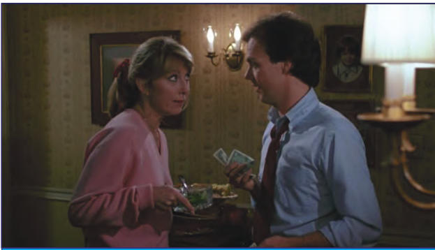
JACK MAKES A WAGER.

son (Martin Mull), seems to find her appealing in an unprofessional and creepy way.