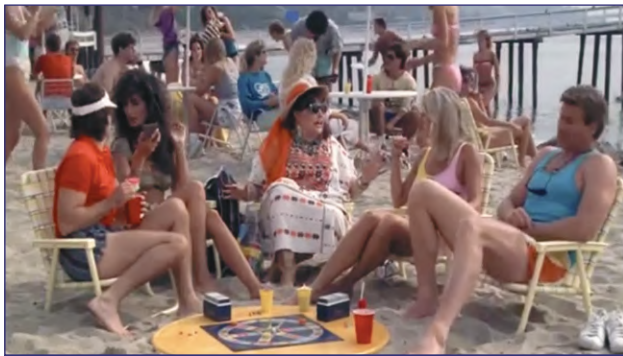
THE CURIOUS BOND: CHOCHKA & THE YUPPIES.

He's grown sick and tired of his only moderately successful and comfortable life, which he hasn't done much to actually earn. But the movie offers no compelling alternative to the vapid yuppie life that Bradley desires. Our "hero" learns little and grows even less, if at all, through his adventure.