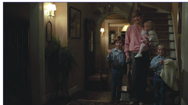
THE GANG'S ALL HERE.

The conclusion of the film is problematic too. It may have originally worked, but is now a glaring missed opportunity. For all its work to explore reversed gender roles within a marriage, the film loses its feminist message when Jack gets his job back and Caroline quits, mainly because of repeated sexual harassment by her boss. According to the Pretty in Podcast episode on Mr. Mom , two early versions of John Hughes's scripts had the film end with the gender roles still reversed, and explored some darker themes that critics of the time and audiences of today might have found more appealing. [6]