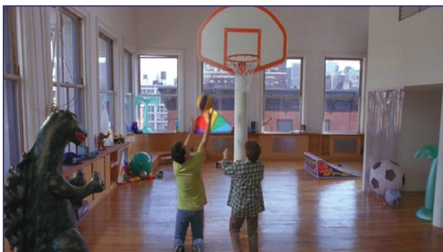
THE BIG SCORE.

That loft is one of the things I loved about this movie as a kid. Josh didn't just get to be-