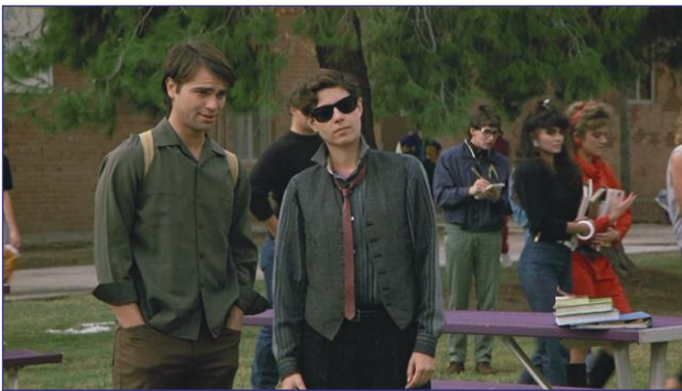
RICK WITH MALE TERRY.

Terry's interactions with Kevin the boyfriend and Greg the bully are in stark contrast to her relationship with Rick. They are both muscle-bound blondes and they represent stifling patriarchal ideas. When Terry is with Kevin, she reacts to his chauvinism as most women would, she snaps back and uses her words. When she's posing as male with Greg, she is forced to resort to other coping mechanisms because she's physically afraid of him.