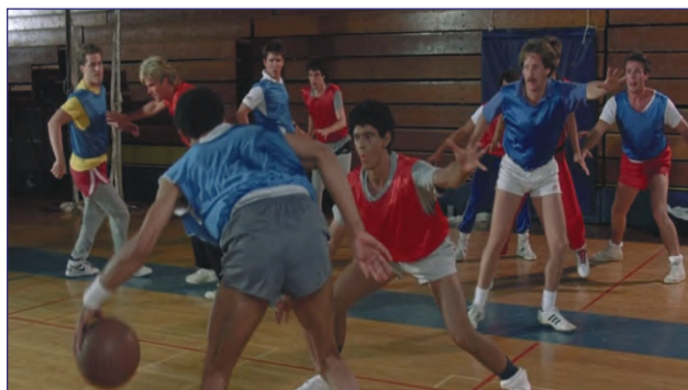
OBLIGATORY BASKETBALL SCENE.

What follows is a series of scenes in which the writers set up racial stereotypes and tired tropes to show that Mark is experiencing the world as a black man would. Two white guys argue over picking him for their basketball teams and when he's not a good basketball player they get mad. Whitney (Melora Hardin), his white neighbor, sleeps with him and uses him to get back at her dad (Leslie Nielsen), who doesn't like black people. And, there is a running gag where he hears the same two guys making racist jokes over and over and then saying, "no offense."