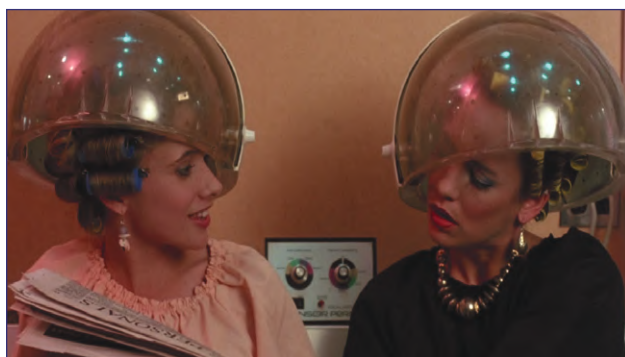
ROBERTA AND LESLIE READ THE PERSONALS.

It's a world much different from yuppie Fort Lee, where Roberta lives with her hot tub salesman husband, Gary (Mark Blum). She is close with Gary's sister, Leslie (the excellent Laurie Metcalf), who relishes the lifestyle. But, Roberta prefers to lose herself in the imagined excitement and romance of The Personals .