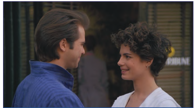
RICK WITH FEMALE TERRY.

Even more interesting is the conclusion of Rick and Terry's relationship. When Rick finds out that Terry is not gay but actually a woman, he's obviously angry, but he eventually comes around and they get together. Rick never spent time with female Terry, he only knew Terry as a guy. For Rick to decide to give Terry a chance means that, on some level, he fell for Terry despite her