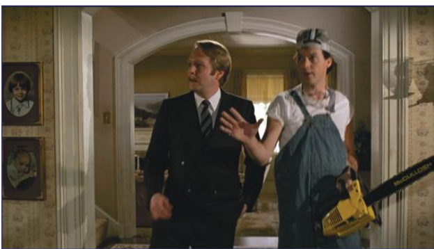
JACK CRANKS UP THE MANLINESS.

When Ron arrives at the Butler home in a limo early one morning to take Caroline on a business trip, Jack feels threatened. He greets Ron wearing overalls and carrying a chainsaw and informs him that he's adding a wing to the house. This sets up one of the film's funniest and most quotable lines when Ron asks Jack if he is putting in a 220-volt electrical line. Jack, having no idea what Ron is talking about, responds "220, 221. Whatever it takes." In an interview with David Letterman, Michael Keaton recounted that it was Martin Mull who fed him that line. It wasn't in the