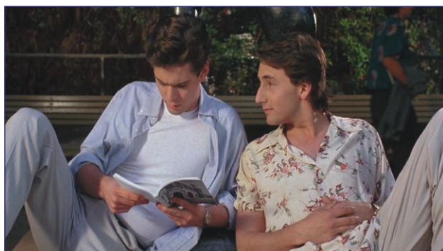
MARK IS ACTUALLY A WHITE GUY.

ning pill. He takes more than the recommended dose, gets a Jheri curl, and disguises himself as a black man in order to qualify for a scholarship that is awarded to a black applicant from the LA area. He lands the scholarship, and when he tells his best friend, Gordon (Arye Gross), about his plan, Gordon tells him he's crazy. Mark tells Gordon to relax because "This is the Cosby decade. America loves black people."