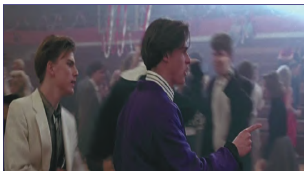
PSYCHO JOEL RUINS EVERYONE'S GOOD TIME.

I used to tolerate this movie more when I was a kid, even rescuing a VHS from a video store closeout sale once upon a time. It wasn't my favorite Corey Haim or Corey Feldman movie (that was Lost Boys ), and it was made worse by the fact that it marked the start of Feldman's weird (and enduring) Michael Jackson phase.