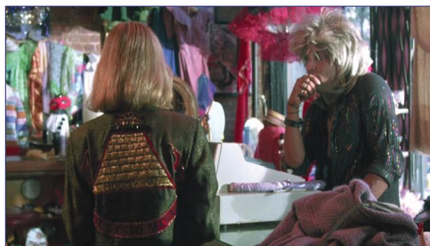
THE JACKET HEARD ROUND THE WORLD.