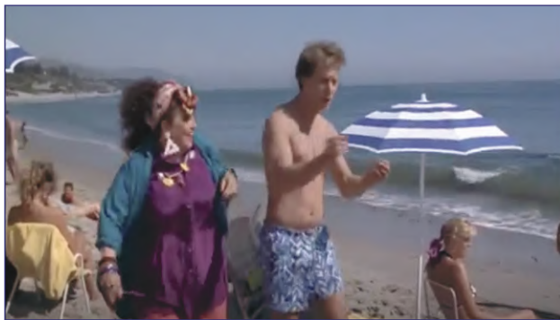
THE LOVE STORY THAT SHOULD HAVE BEEN.

He's grown sick and tired of his only moderately successful and comfortable life, which he hasn't done much to actually earn. But the movie offers no compelling alternative to the vapid yuppie life that Bradley desires. Our "hero" learns little and grows even less, if at all, through his adventure.