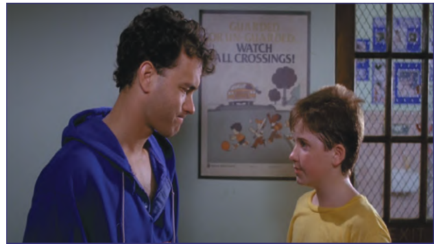
THE BIG PROBLEM.

Josh tries to immediately undo the wish, but the carnival is long gone. He understandably fails to convince his mother (Mercedes Ruehl) that he's her little boy, even pulling down his pants to reveal cartoon-patterned underwear and a birthmark. So, his last best hope is his madly loyal, wiser best friend, Billy (because if anyone is going to believe Josh, of course it would be a kid).