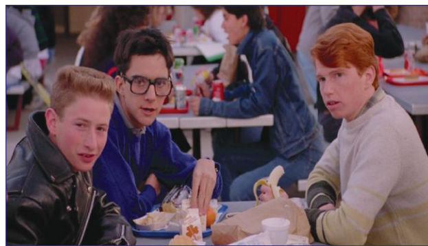
IT'S A NERD HERD!

As time goes by, Ronald's popularity grows at the same rate as Cindy's disdain for him. He dates all of Cindy's friends, he lets his grades slip, and he acts like an absolute asshole. Everything comes to a head at a New Year's Eve party when Cindy sees Ronald in the bathroom with some random girl and hears him quote one of her poems. Cindy loses it. She tells the whole party about their secret, and Ronald's high school rule comes to an end.