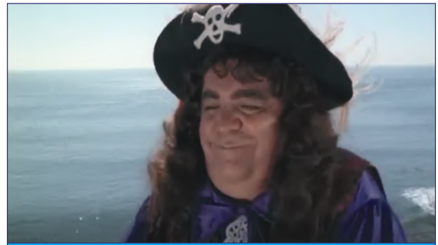
BEST PART: JAMES COCO IN GOOFY COSTUMES.

The criminally underutilized James Coco does what he can to make an interesting devil, insufficiently called "Dr. D," and heroically makes the