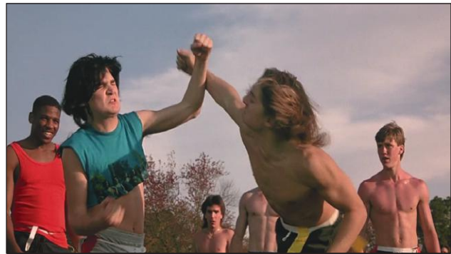
BOBBY GOES FOR THE C-C-COMBO BREAKER.

The real Bobby shows up in dream sequences to complain to the real Coleman that he doesn't know how to teen-age (because every adult in this movie is an insensitive moron) and that he's wrecking his social life. (To be fair, though, Coleman is doing wonders for his academics). Told he has limited time to find Gena, Coleman seeks