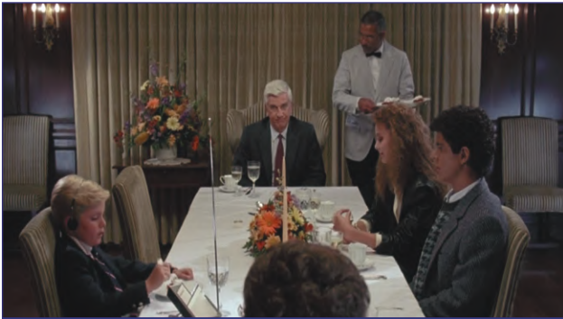
LESLIE NIELSON CAN'T BELIEVE HE'S IN THIS MOVIE.

Everyone involved with the movie defended it. Rae Dawn Chong gave an interview in 1986 in which she said, "There are some horrible black jokes in 'Soul Man' but they aren't designed to offend anyone. When a film takes the risk of showing the realistic side of bigots, then people get up in arms. They acknowledge racism exists, but they don't want it to be seen. We took a brave stance. Instead of just talking about racism, we showed it." [2]