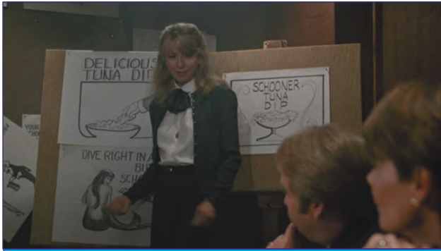
CAROLINA MAKES A TUNA PITCH.

young once. He asks her about their relationship status. She's torn but leaves with Ron, and Joan shows up at Jack's side moments later. The film wraps up rather predictably after that