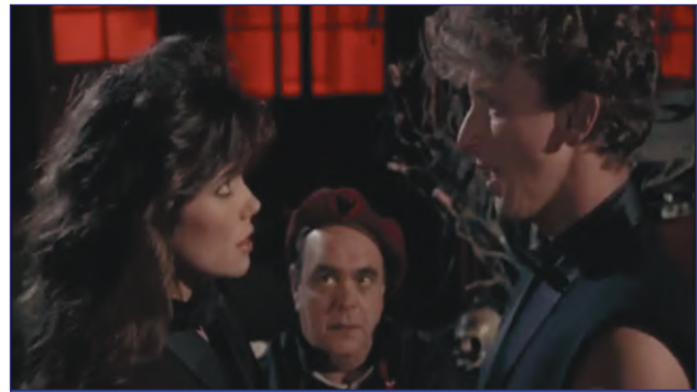
BORING DUDES. NEEDS MORE DEVIL.

Back to the movie. It sucks. A typical Faustian