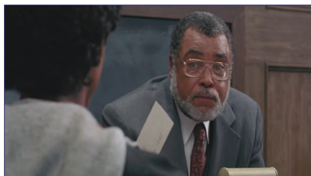
JAMES EARL JONES CAN'T BELIEVE HE'S IN THIS MOVIE.

In the midst of all this, Mark is struggling in his criminal law class with Professor Banks (James Earl Jones) who tells Mark that at no point will he cut him any slack. And finally, he has fallen for Sarah (Rae Dawn Chong), another black student. Eventually, she starts to fall for him too and it comes out that she would have gotten his scholarship if he hadn't applied for it. Suddenly, Mark realizes that he was wrong to pretend to be black. It takes an awful lot for him to realize this.