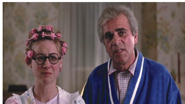
PARENT'S JUST DON'T UNDERSTAND.

I'd like to think that, early in the production, there was some semblance of a good movie, and that's why respected veteran actors like Jason Robards, Piper Laurie, and Harry Dean Stanton signed on. Roger Ebert, who wrote a scathing review, said it was the one movie that defied the "Stanton-Walsh" rule of filmmaking which states that a movie with Harry Dean Stanton or M. Emmet Walsh can't be all that bad. [1] Well, it was, but to